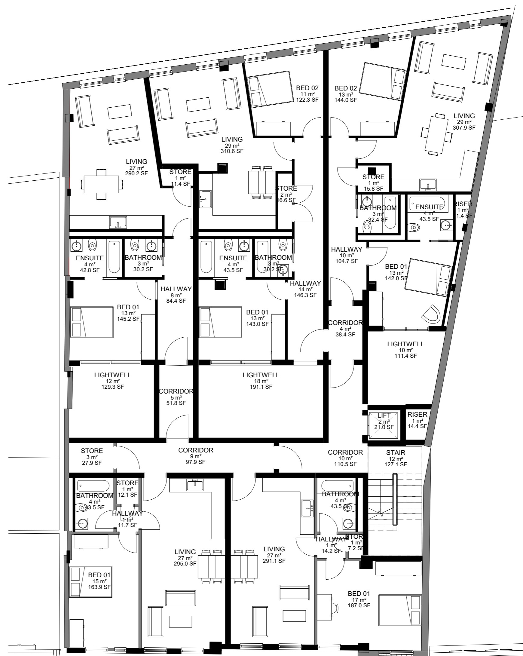
2 04001 FIRST FLOOR - GA PLAN 00100 1 1 : 100