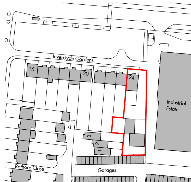
Proposed Location Plan Scale 1:1250