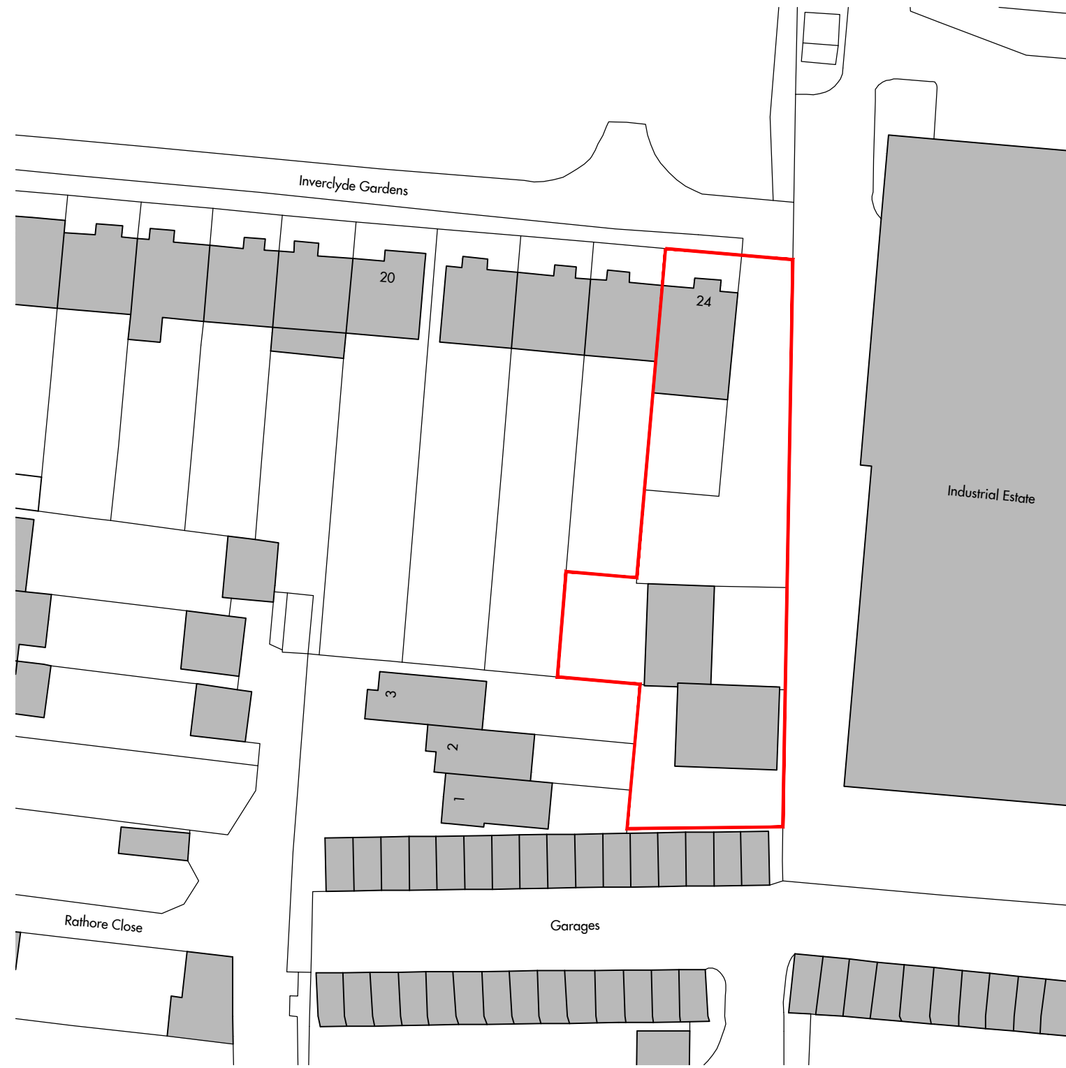
Proposed Site Plan Scale 1:500

Boundary: — Boundary referenced from OS map Information