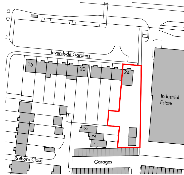
Existing Location Plan Scale 1:1250